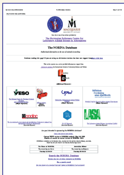
Part of NORINA's Home Page